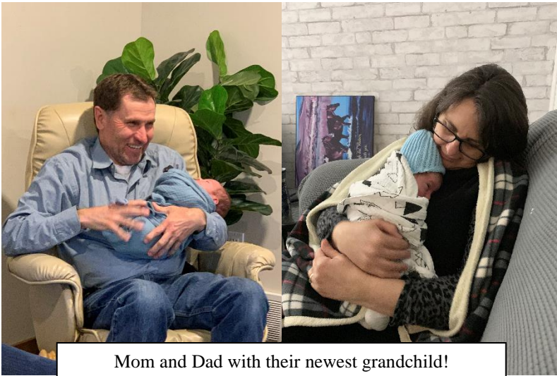
Mom and Dad with their newest grandchild!

Since we are first-time parents, it has been quite an adjustment for us, although we have nothing to complain about. Our baby is healthy, happy, and sleeps well for the most part, so learning to adjust has not been very difficult. We are just starting now to get back into the swing of things. I have not been able to keep up with producing the radio program Kjikj Nopp! quite every week, but now that we have started finding our rhythm again I'm able to get back on track. We have also